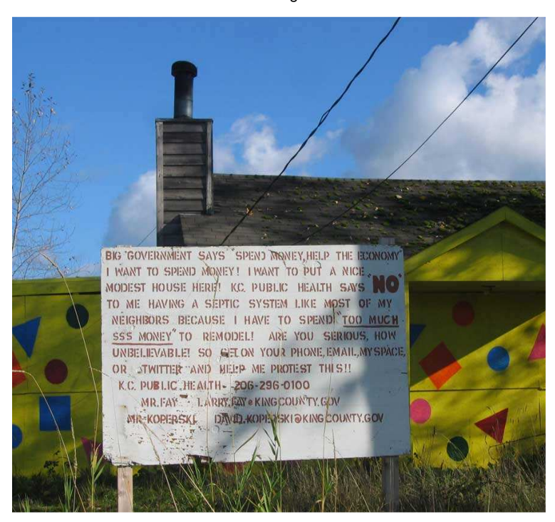
I. Understating How Much The Municipal Racket Extorts