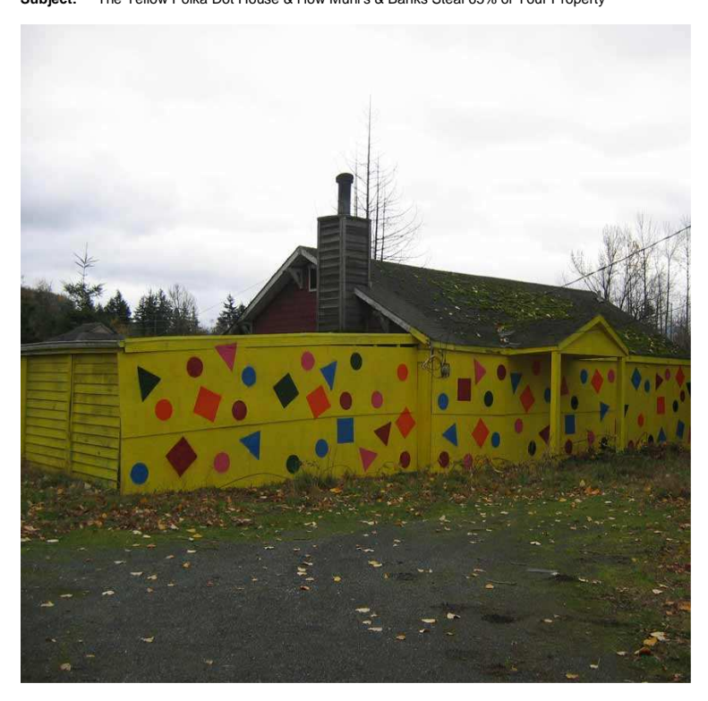
244th Ave SE & SE 464th Enumclaw, Washington, Ole town of Boise, Washington